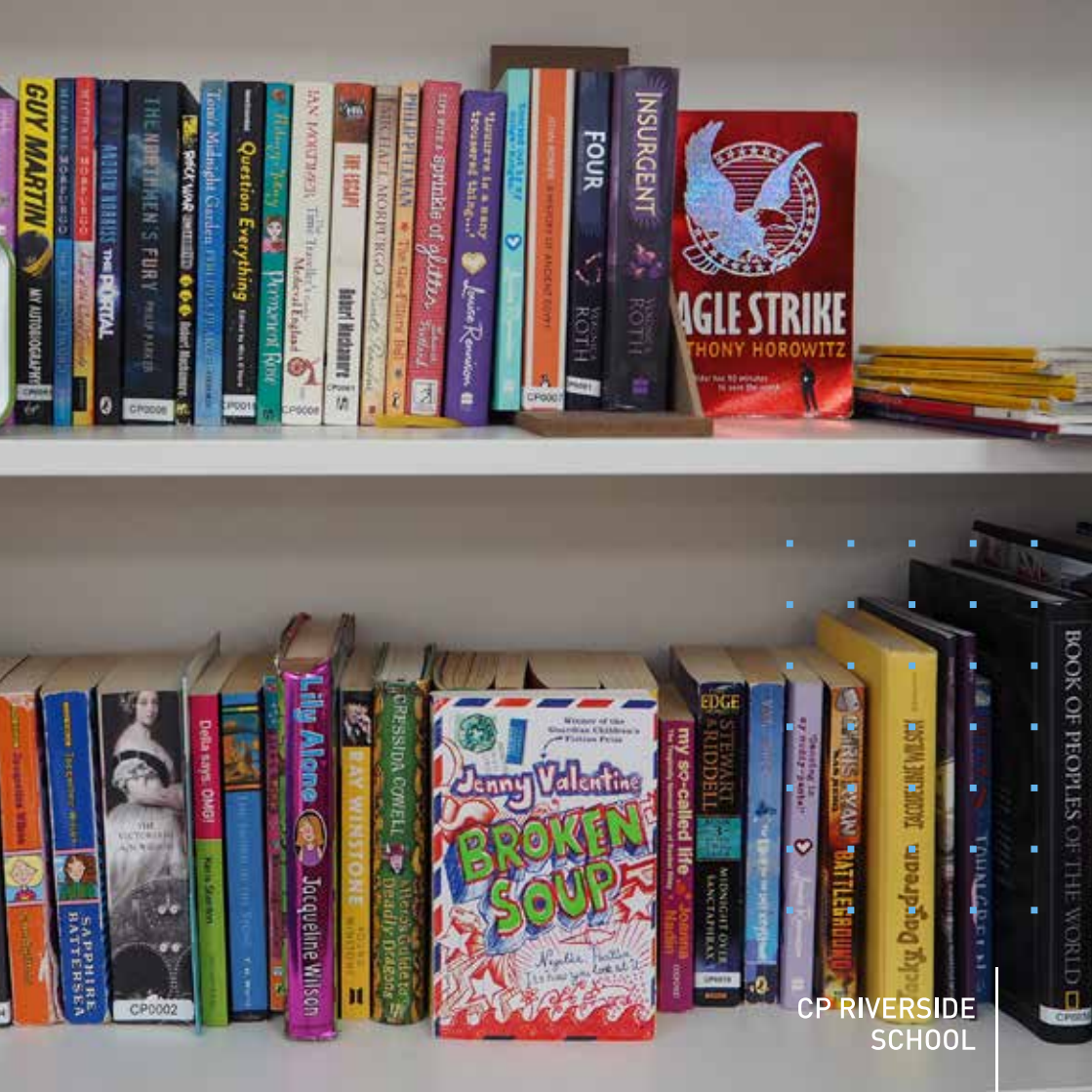
CP RIVERSIDE SCHOOL